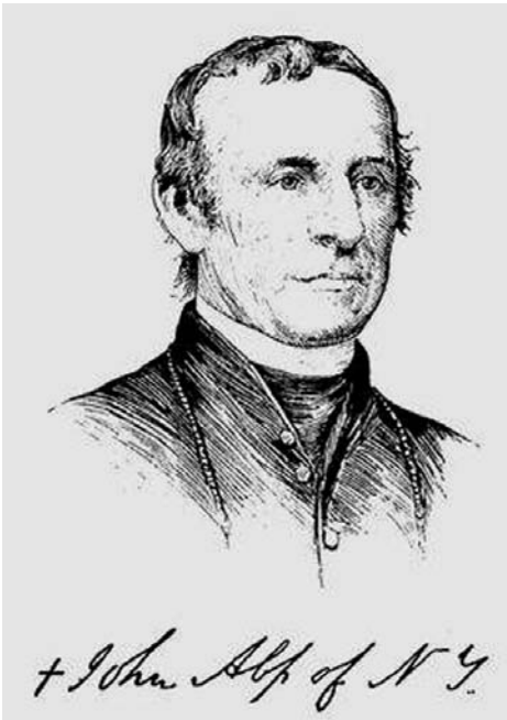
John Hughes, Fourth bishop and first Archbishop of New York. It was the symbol of the Cross in his signature that gave rise to his nickname "Dagger John"